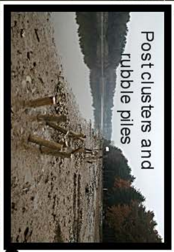
Post clusters and rubble piles