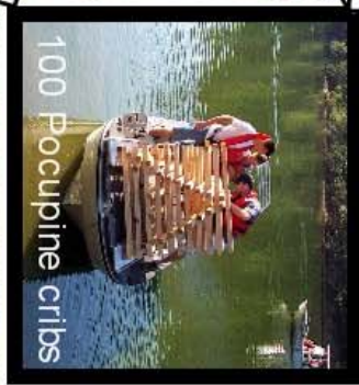
100 Pockpine cribs